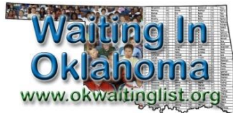
Waiting List by Residence Type

The "Age and Length of time" information is gathered by OKDHS. OKDHS uses their existing system along with other systems and reconcile the service recipients names with the waiting list names. It is a current as available to OKDHS.