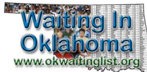
Waiting List by Residence Type

The "Age and Length of time" information is gathered by OKDHS. OKDHS uses their existing system along with other systems and reconcile the service recipients names with the waiting list names. It is a current as available to OKDHS.