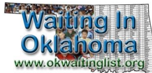
Waiting List by Residence Type

The "Age and Length of time" information is gathered by OKDHS. OKDHS uses their existing system along with other systems and reconcile the service recipients names with the waiting list names. It is a current as available to OKDHS.