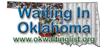
Waiting List by Residence Type

The "Age and Length of time" information is gathered by OKDHS. OKDHS uses their existing system along with other systems and reconcile the service recipients names with the waiting list names. It is a current as available to OKDHS.